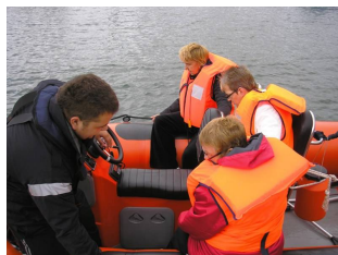
Cedar Grove Foundation

As a result of the Tall Ships event we were contacted by a number of groups and organisations that work with young people with learning difficulties and Autism. On one evening we had over 50 people arrive to try sailing/boating for the first time. Even so we still managed to get everyone who wanted to be on the water in one boat or another.