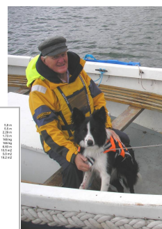
Bob Harper & Oska